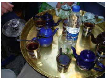
Khan El Khalili

09:30 Check out from hotel. Departure by bus to visit the citadel of Saladin and the Mosque of Mohamed Aly. Lunch in docking boat restaurant on the Nile. P.M. visit the Egyptian Museum. Tour in the Khan El Khalili Bazaar. Transfer to the train station for night departure by Wagons-lits (Sleeping Train) to Aswan. Dinner and overnight on train.