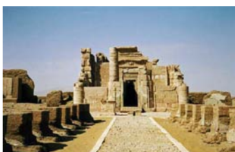
Deir El Hagar

Departure to Dakhla Oasis. visit El Qasr (Medieval Islamic Citadel and old capital of the Oasis, with a tight small streets and mud houses). Will end the day by visiting the Roman Temple of Deir El Hagar. Dinner & overnight in hotel.