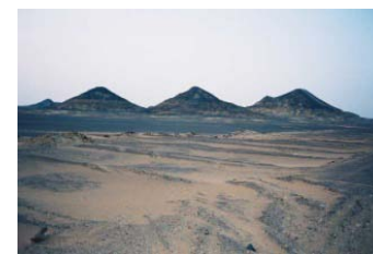
Road to Siwa

Departure by jeep to Siwa, crossing the old caravan road (many check points will be met, where we will be required to show our passports). Visit the Lake of Sitra, on a limestone plateau on an undrained basin where low grass and bushes still survive. The settlement zone was large, over an area measuring 1000m by 500m. The entire region is so rich in fossil shells shaped coin, shark teeth, corals, etc.. Arrival to Siwa by sunset, check in your hotel, dinner and overnight.