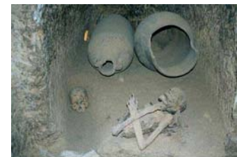
Mountain of the Dead

Full day dedicated to the discovery of Siwa and the surrounding, visit the Temple of Amon where Alexander the Great was declared as Pharaoh, son of the God Amon Ra. Visit Gebel El Maota (The Deads Mountain) and the Cleopatra's Bath, with the opportunity of bathing in its hot water. Dinner & overnight in hotel.