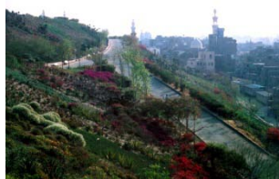
Park El Azhar

Century royal portraits, costumes and furnishing also in the citadel you will visit The Harem Palace was built in 1827 and reflects the Levantine style of Mohamed Ali .it was the residence of the royal family until 1874 then it was converted into a museum in 1946 and showed the military history of Egypt and at the end of your visit to the Citadel you will visit the tomb of Mohamed Ali Pasha. Lunch in El Azhar Park, designed by Aga Khan surrounded by the most significant historic districts of Islamic Cairo including a wonderful panoramic view of the area. Then after a small walk in Khan El Khalili you will visit an example of a private Egyptian home of the 17th. Century called El Suhaymi House, the house purchased in 1796, there are various separate staircase entries and about thirty chambers on various level, on the street side of the house, the women's bedroom windows have a mashrabiyya screens, while in the rear screened and latticed windows. Back to hotel dinner & overnight