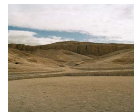
Valley of kings

After breakfast, departure by a/c car to visit the west bank of Luxor. Starting by the Valley of Kings the isolated valley is dominated by the natural pyramid-shaped mountain. It consists of two branches, the east & the west valley with the former containing most of the royal burial sites. The second stop is The Valley of Queens where are at least 75 tombs,