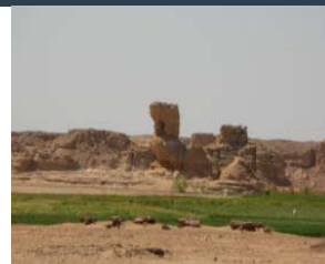
Deir El Hagar

Departure to visit the spellbinding medieval village of Al-Qasr & the temple of Deir El Hagar dedicated to Amun god, enjoy a swim in the Pharaonic water wells.