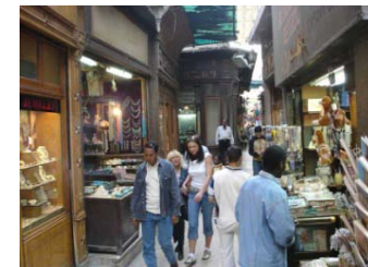
Khan El Khalili

Day at leisure for a free tour in Cairo or for relaxing around your hotel's pool.