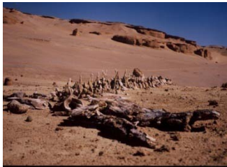
Valley of the wales

Departure by Jeep for the visit of Wadi Hitan (Valley of the Wales), picnic lunch en-route to the Djara Cave: one of the very few well decorated caves in Egypt. A cave of magical dimensions, the Djara cave is the natural result of pure water in contact with the dry desert climate, over millions of years of formation.